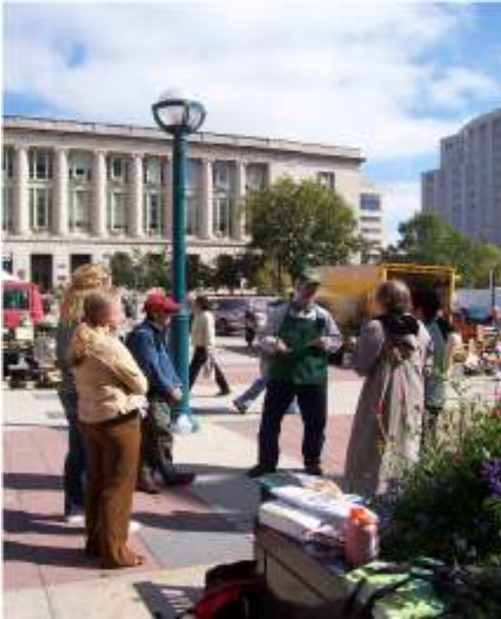
Green Concierge Travel's Make the Connection Tour uses the city bus and walking to explore food in Madison