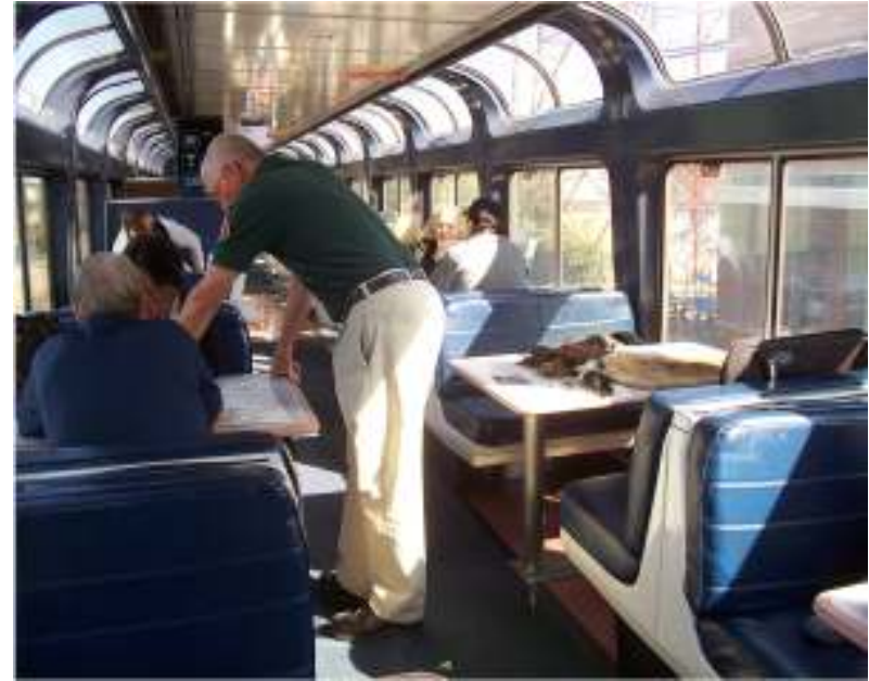
Long distance rail service

September 10 th , 2010 TIES – Portland, OR