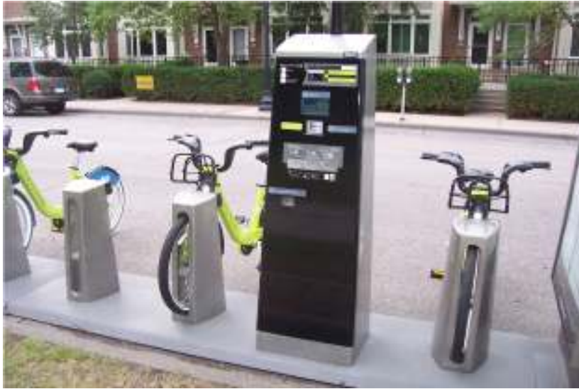
On the spot bike rentals and bike sharing such as Nice Ride in Minneapolis