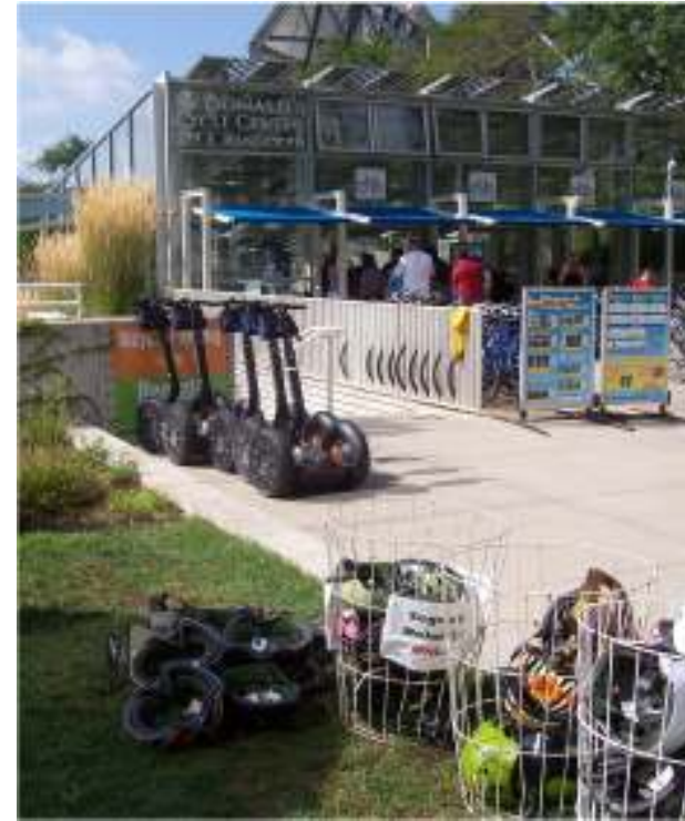
Chicago's McDonald's Cycle Center offers facilities for commuters and tourists – bike rentals and tours, segway tours, showers and lockers