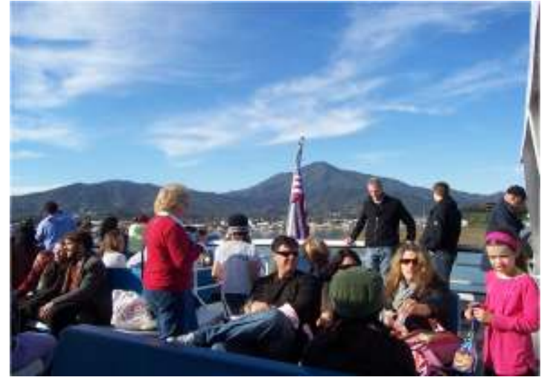
Local rail and ferry systems – Golden Gate Ferry service